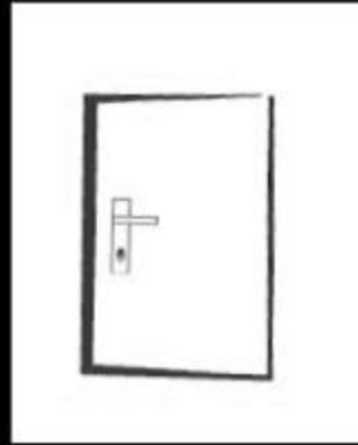
Plate Style Handle